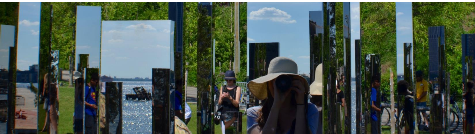
Location: Hide Park, Sydney | Labyrinth maze of mirrors - Art installation

The mirror sheets are placed following the sorting (for the mixed pallet) required by the customer. The standard quantity of goods on each full pallet is about 1 ton.